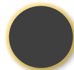
Positioned On The Mirror Edge